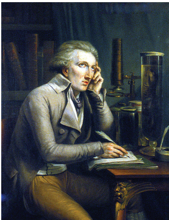
FIGURE 2. Jean Léopold Nicolas Frédéric CUVIER, known as Georges Cuvier (1769 Montbéliard - 1832 Paris), who established the scientific disciplines of comparative anatomy and paleontology. Portrait by Mattheus van Bree.

Alexandre Brongniart (1770-1847) was a mineralogist, geologist, zoologist and paleontologist, and is considered, together with Cuvier, as one of the founders of stratigraphic paleontology. His son, Adolphe Théodore Brongniart (1801-1876) is clearly considered to be the originator of the discipline of paleobotany in France, as he followed and adapted the studies of Kaspar Maria Sternberg (1761-1838) in Bohemia and Ernst Friedrich von Schlotheim (1765-1832) in Germany. A.T. Brongniart published the first classification and distribution of fossil plants, with comparisons to their nearest recent relatives, in his Histoire des végétaux fossiles (1828-1837).