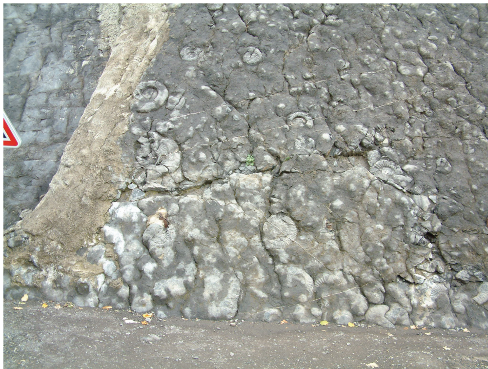
FIGURE 1. The "dalle à ammonites" is the most famous fossil locality of the Réserve Naturelle Géologique de Haute Provence. A slab of 320 m 2 shows 1550 ammonites of the species Coroniceras multicostatum, up to 70 cm in diameter, indicating an early Jurassic age.

gen (Germany), he left for Stuttgart where he studied natural sciences. He moved to France where he got a professorship at the Muséum National d'Histoire Naturelle (MNHN) in 1802. He presented his first paleontological studies at the Académie des Sciences since 1796, establishing the widely used concept of "catastrophism". With his four volumes on the Recherches sur les ossements fossiles de quadrupèdes , published in 1812, Cuvier can be considered as the originator of vertebrate paleontology. It was also Cuvier who first defined the Jurassic as a geological period.