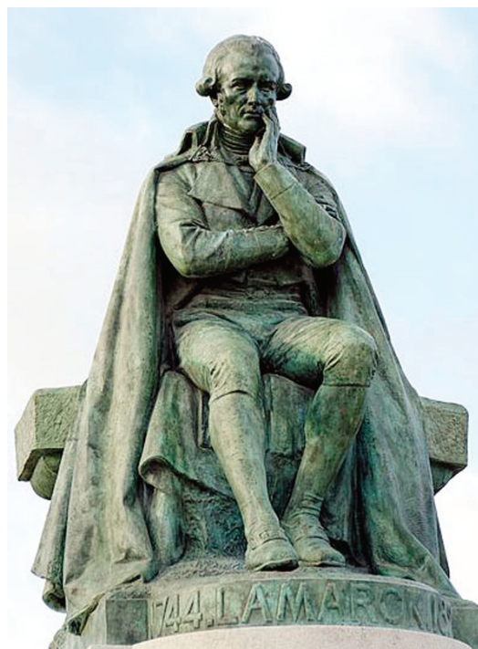
FIGURE 3. Jean-Baptiste Pierre Antoine de Monet, chevalier de LAMARCK, known as Jean-Baptiste de Lamarck (1744-1829), who contributed to the classification of invertebrates, a term he coined, and an early proponent of evolutionary studies. Statue by Léon Fagel in front of the Place Valhubert entrance of the Jardin des Plantes in Paris.

Alcide Dessalines d'Orbigny (1802-1857) had a specific interest in marine organisms; he coined the term “ foraminifères ” (foraminiferans) in 1825. D'Orbigny started the ambitious publication Paléontologie française , a series containing over 4000 pages and 1440 lithographic plates. He is considered to be the founder of micropaleontology and he promoted not only biostratigraphic paleontology ( Prodrome de Paléontologie Stratigraphique , 1849) but also paleogeography, in particular for the Mesozoic.