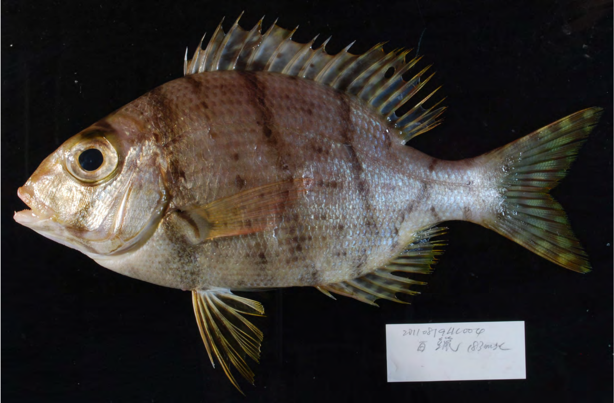
Fig. 3 - Chen et al.