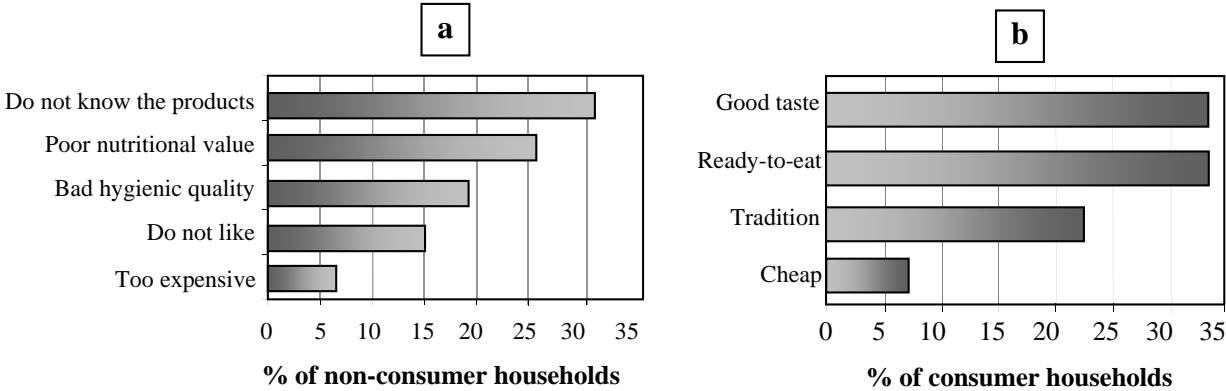
Figure 1. Main reasons cited by households for not consuming (a) or for consuming ben-kida or ben-saalga (b)